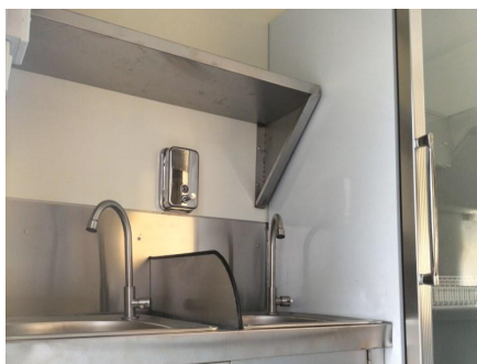
- Sinks -