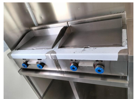
- Grills -