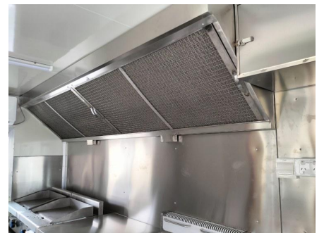
- Exhaust Hood -