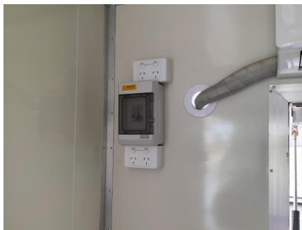
- Electrical System -