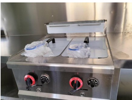
- Fryers -